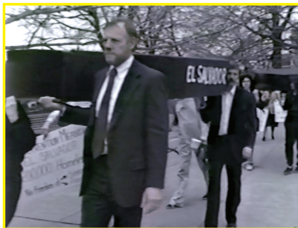
Central American Days of Protest (1985)