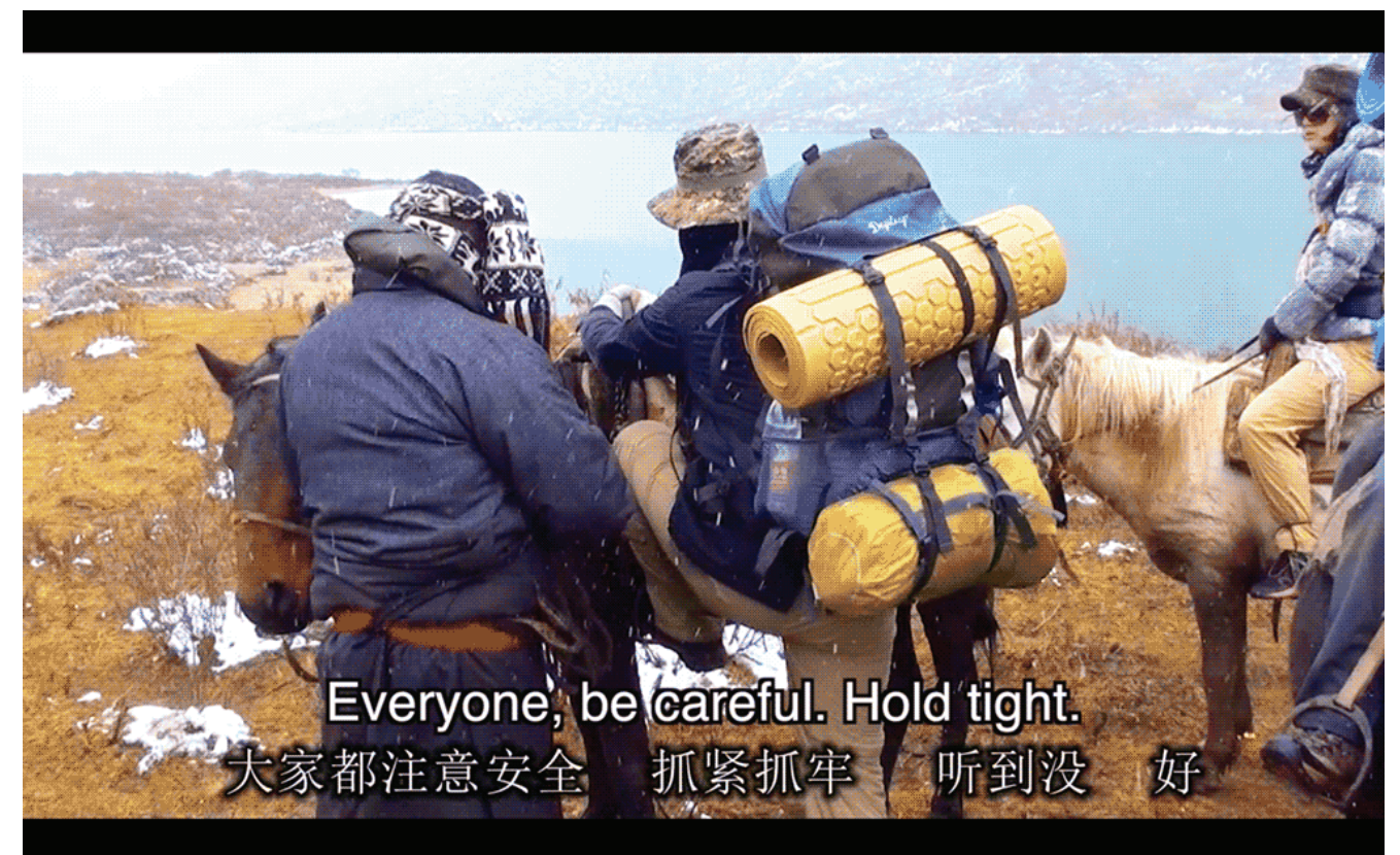
Top: Still from Yak Dung (2016); Bottom: Still from The Tourists (2017) Cover: Still from Through the Looking Glass (2017)