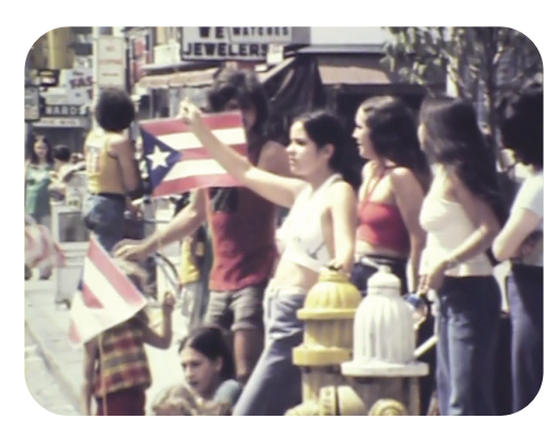
P'al Festival (1976)