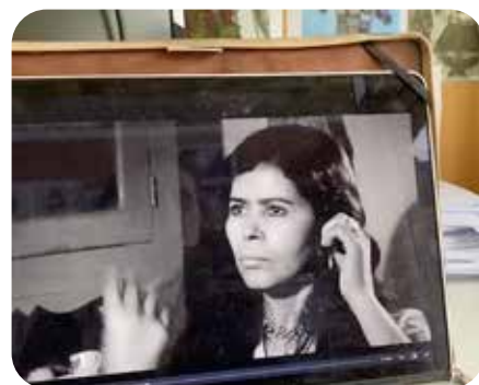
Still from The World Like a Jewel in The Hand: Unlearning Imperial Plunder II by Ariella Aïsha Azoulay

The SLUDGE Film series offers an evening’s experiment of mashed up titles and topics from VSW’s 16mm collection, finding new meaning in old formats and playing with our new tempos of media consumption. 16mm film is media evidence of the cultural values of 20th century America, a format both dictating and reflecting educational standards and national viewpoints of yesteryear. SLUDGE takes its name from a contemporary TikTok fad of watching multiple unrelated videos simultaneously. How can we confront old media with our new attention spans and global perspectives? This series is curated and projected by Mary Lewandowski, VSW’s Curatorial & Research Associate.