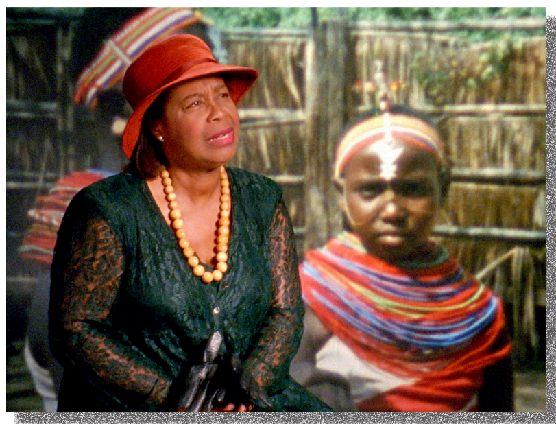
Still from Halimuhfack (2016)

Christopher Harris's films are visually musical compositions that use experimental techniques to call attention to the political aesthetics of racism, capitalism and African American culture. Influenced by avant-garde cinema, jazz music, and archival media, Harris's body of work includes 16mm film, HD video and multimedia installation. Harris' films fluidly engage elements of duration, absence and silence to bring viewer's attention to the experience of film as a temporal and spatial medium, while also celebrating the poetic, sensorial experience of the moving image and its associations. As part of our In Dialogue series, Harris has selected a program that includes films from the VSW archive along with his own works, including his most recent film, Speaking in Tongues: Take One . Christopher Harris will be in person for a Q&A following the screening.